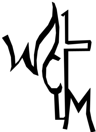
WESLEYAN CAMPUS MINISTRY TEXAS A&M COMMERCE

At the Wesleyan Campus Ministry this semester, we are launching a new way for all churches in our East District to support campus ministry: at the Wesleyan and/or at Paris Junior College. It's called the "12:15 Campaign." We will be asking churches and members to pledge to donate $15 (or more) per month for 12 months and to pray for campus ministry everyday at 12:15pm (or am if you're a night owl).