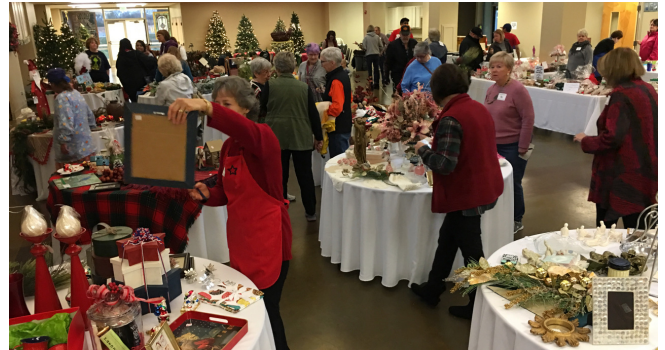
2016 Merry Marketplace

Orders for fresh evergreens are due Monday, November 6. Look for order forms in the Gathering Area or in the church office to share with friends and coworkers, or order online from the church's homepage.