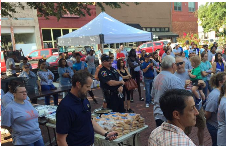
(Our church presence is under the tent in the background)

We had several volunteers who worked at the FUMC-C table and connected with the community while handing out bottles of cold water that were donated by Fix & Feed.