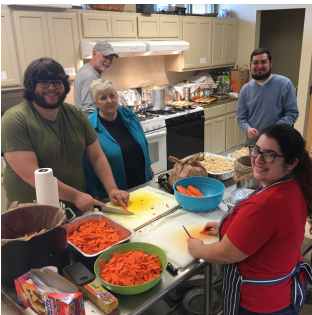
Nothing brings people together like good stew!

Together, we can make it merry! We need your help to craft, bake, donate, promote, set up, price, sell, and clean up. Please contact Angela Roberts at 972.765.6547 to get involved.