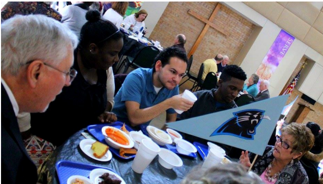
Choir members fellowship

Way to go team for making a tackle against hunger at the Souper Bowl of Caring Luncheon! $711.79 was collected through drop-a-dollar giving and donations placed in the soup pot at the lunch on February 7! The Serve team allocated additional funds bringing the total to $1,000 so that the food pantries at First Presbyterian Church and Bread of Life Church of Nazarene in Commerce each received $500. Thank you to all who decorated, cooked, served, cleaned-up and gave to make this one of the best Souper Bowls yet!