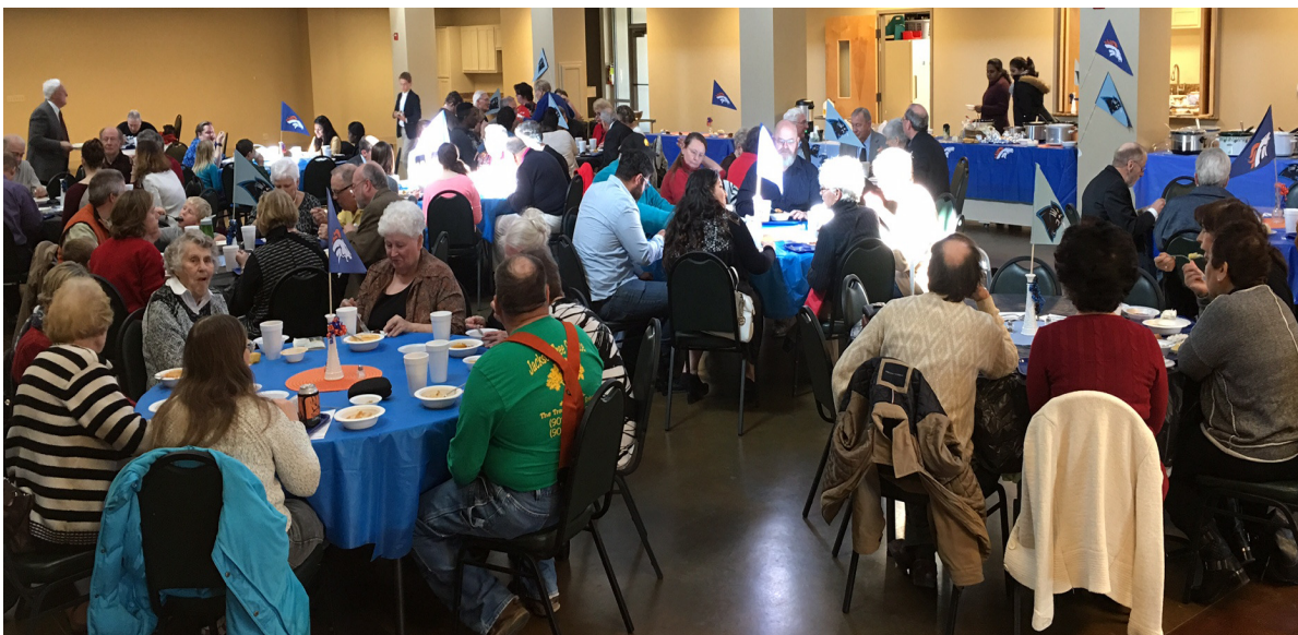
Over 100 huddled up to break bread