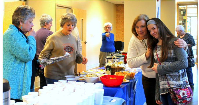
Set-up crew finalizing buffet line