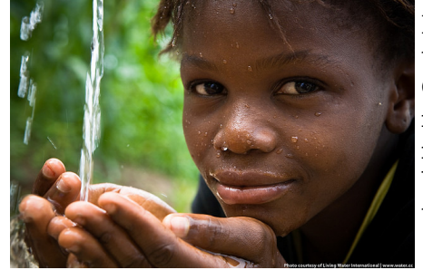
Living Water International – Providing a Cup of Water in Jesus' Name

Will you participate in this challenge too by donating the money saved from drinking only tap water during the week of VBS to Living Water? Jesus said that to give a drink to the least of our thirsty brothers is to give a drink to him. Just think of the size of the benefit if both VBS kids and church members participated in this challenge!