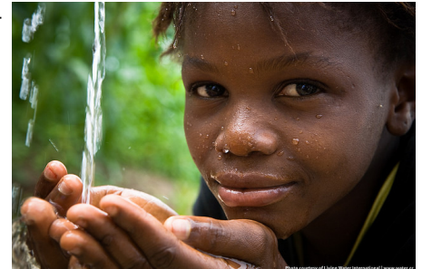
Living Water International – Providing a Cup of Water in Jesus' Name

Over the week, our VBS kids saved $175 by drinking water instead of juice boxes and collected $610 for a total of $785. The June drop-a-dollar and designated offerings totaled approximately $700 for a grand total of $1485 that will be donated to Living Water International for the drilling of water wells.