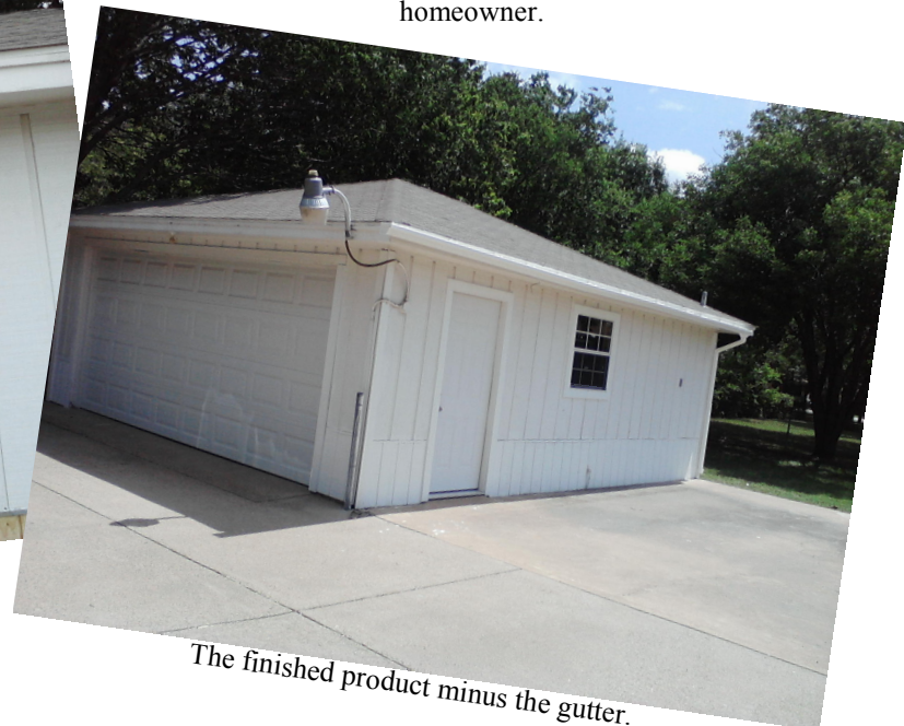
The finished product minus the gutter.