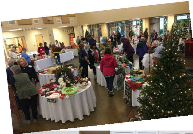
The Merry Marketplace offered a wide array of items all donated by members and friends of FUMC-C.