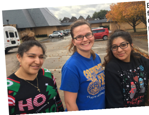
Employees from Smile Corner Dentistry provided smiles and helping hands.