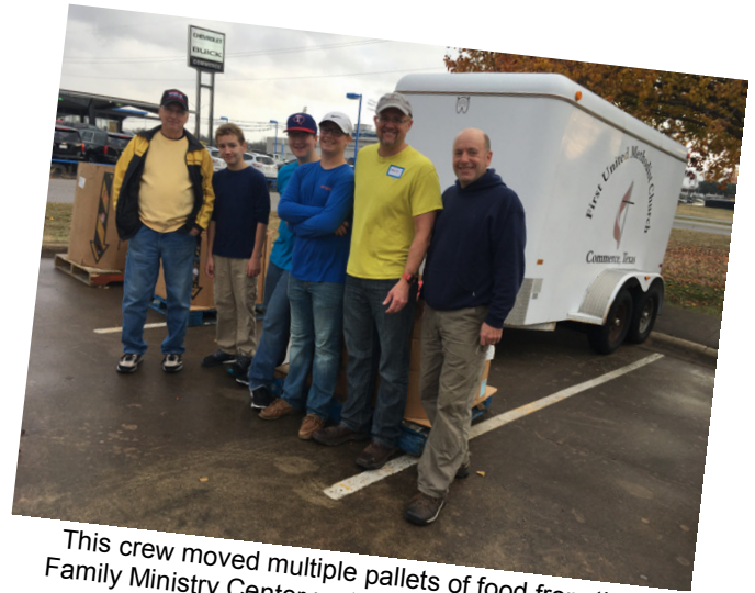
This crew moved multiple pallets of food from the Family Ministry Center up the hill to Methodist Drive so we could easily load cars.