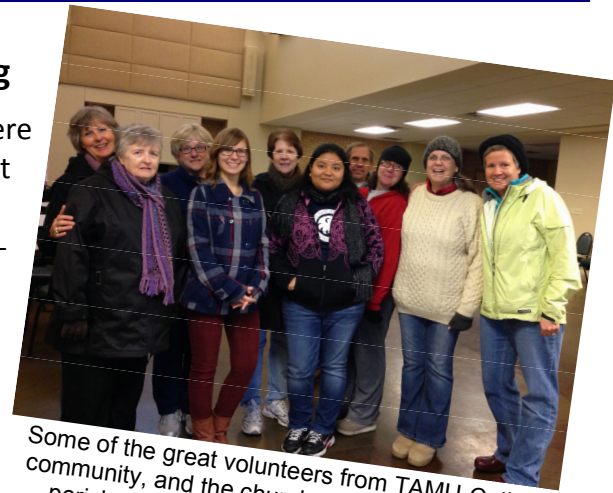
Some of the great volunteers from TAMU-C, the community, and the church who organized non-perishables the day before the distribution.

now have the food they need to celebrate the Thanksgiving holiday week with loved ones. Mark your calendars for December 21st. We're be doing it again for Christmas!