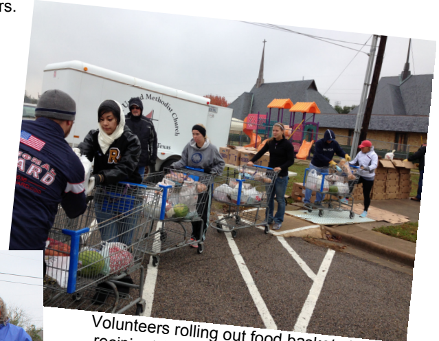
Volunteers rolling out food baskets to recipients' cars in the drive-thru line.