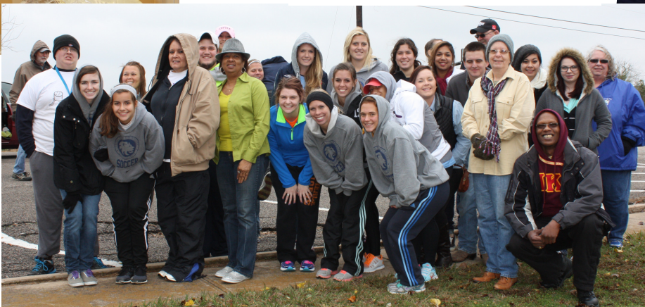
More of our awesome volunteers at the conclusion of the distribution