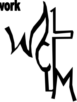
WESLEYAN CAMPUS MINISTRY TEXAS A&M COMMERCE

The Wesleyan Campus Ministry (WCM) serves the town of Commerce, Texas; Texas A&M University-Commerce (A&M-C), and the surrounding communities by providing a place where all of God's diverse children can become, believe, and belong. We are the only Reconciling Ministries Network (RMN) community in the East District. We came to this decision several years ago as a means of achieving better evangelism to the high number of LGBTQ+ individuals in the surrounding area, particularly those who are students at A&M-C. In the wake of joining the RMN and publicizing our status as a "Reconciling Community," our number of attendants increased and has spawned several groups that minister to the LGBTQ+ community, such as Love Group and QPOC (Queer People of Color). We have also reached new students who are members of on-campus organizations such as the Pride Alliance. In the aftermath of General Conference 2019 (GC19), the RMN has gained over 2,000 new members from hundreds of churches around the globe.