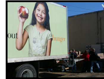
North Texas Food Bank truck arrives in Commerce