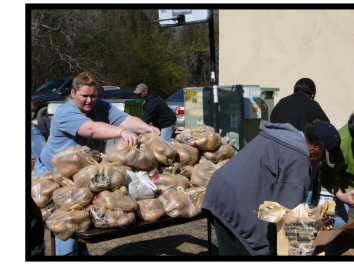
Sorting and bagging of food for Commerce Food Distribution and Manna Movers