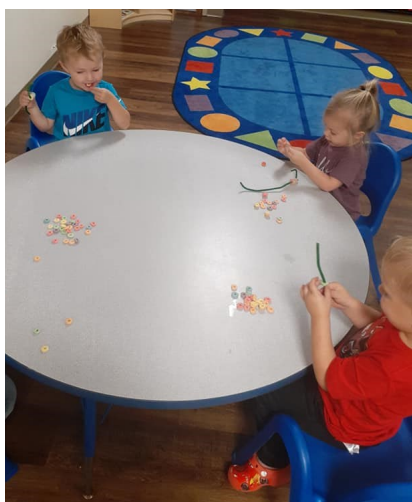
Toddler 2 Class

We are continuing with the protocol of parents not being allowed in the building at this time. We take daily temps (kids and employees) with a no-contact thermometer and are very vigilant in our cleaning.