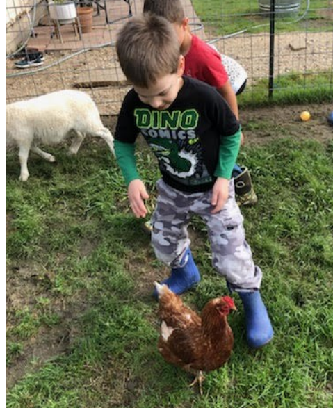
Pre-K had a fun trip to a farm!