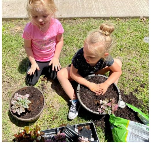
Little Ark Preschool planted flowers