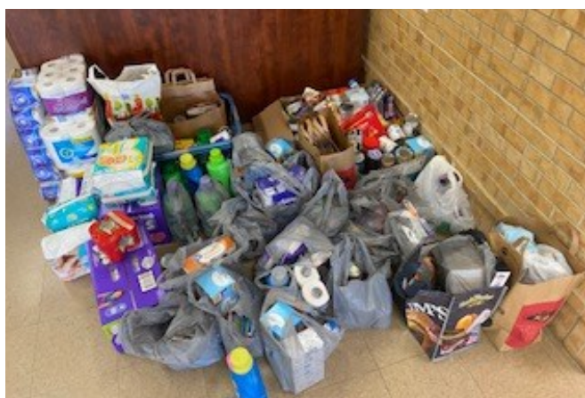
Donations from the reverse advent calendar.

Pre-K and preschool will start back on Tuesday, January 12.