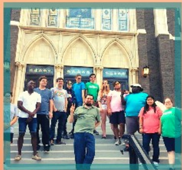
A ministry of the United Methodist Church