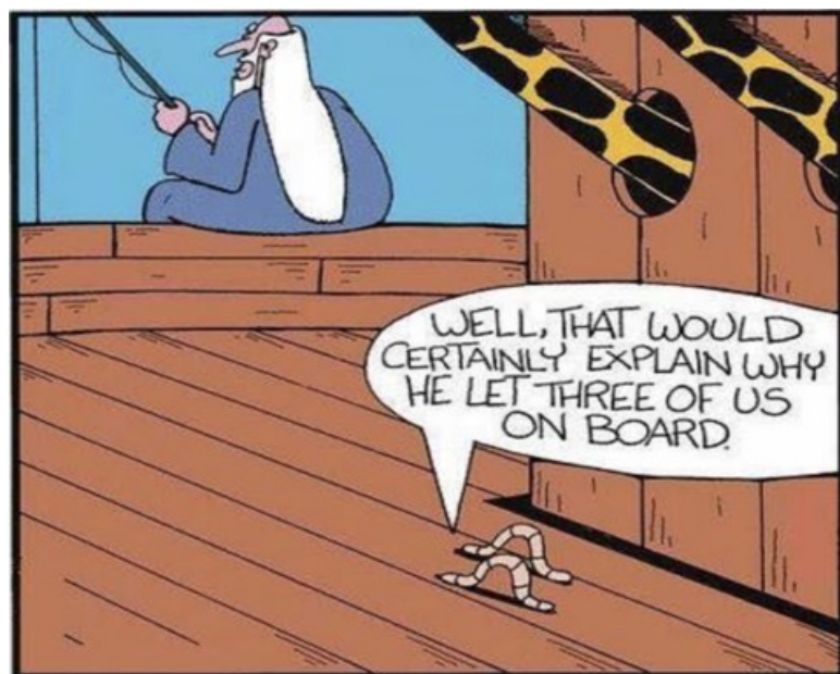
The CARTOON KRONICLES